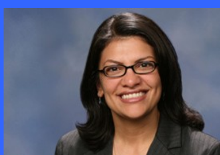
Rashida Tlaib Take on Hate