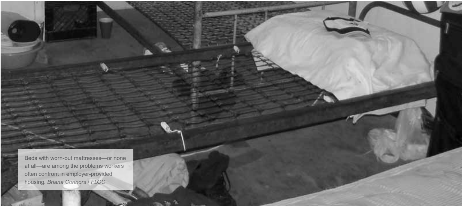
Beds with worn-out mattresses—or none at all—are among the problems workers often confront in employer-provided housing.